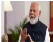
'We made improvements in EC, during Cong rule ...': PM