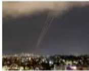
Hezbollah, Hamas, Houthis: How Iran formed 'Axis of Resistance' aroun...