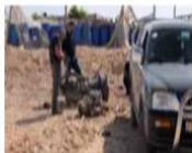
Why US and Israel have avoided direct military strikes on Iran